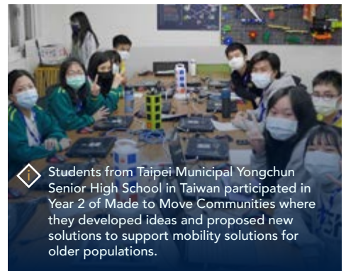
Students from Taipei Municipal Yongchun Senior High School in Taiwan participated in Year 2 of Made to Move Communities where they developed ideas and proposed new solutions to support mobility solutions for older populations.

Through our new Corporate Social Responsibility program, we aim to inspire student innovators from around the world to apply creative, technology-based solutions to eliminate mobility challenges in underrepresented communities.